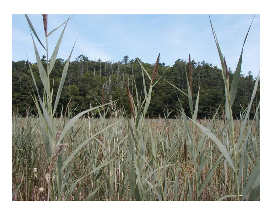
Photo 4. Phragmites stems showing development of tassels (seed heads) on old dead stems and current years growth. August 2008.