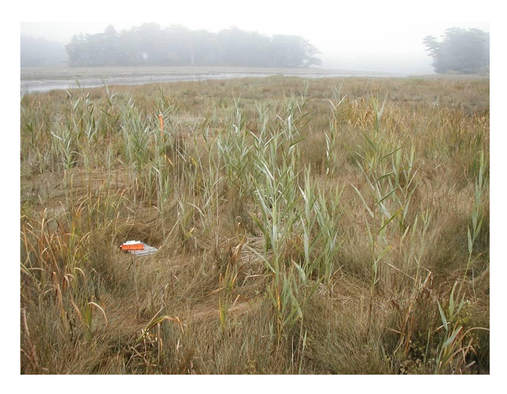
Photo 3. Typical small Phragmites patch with low stem density in vegetated marsh zone. August 2008.