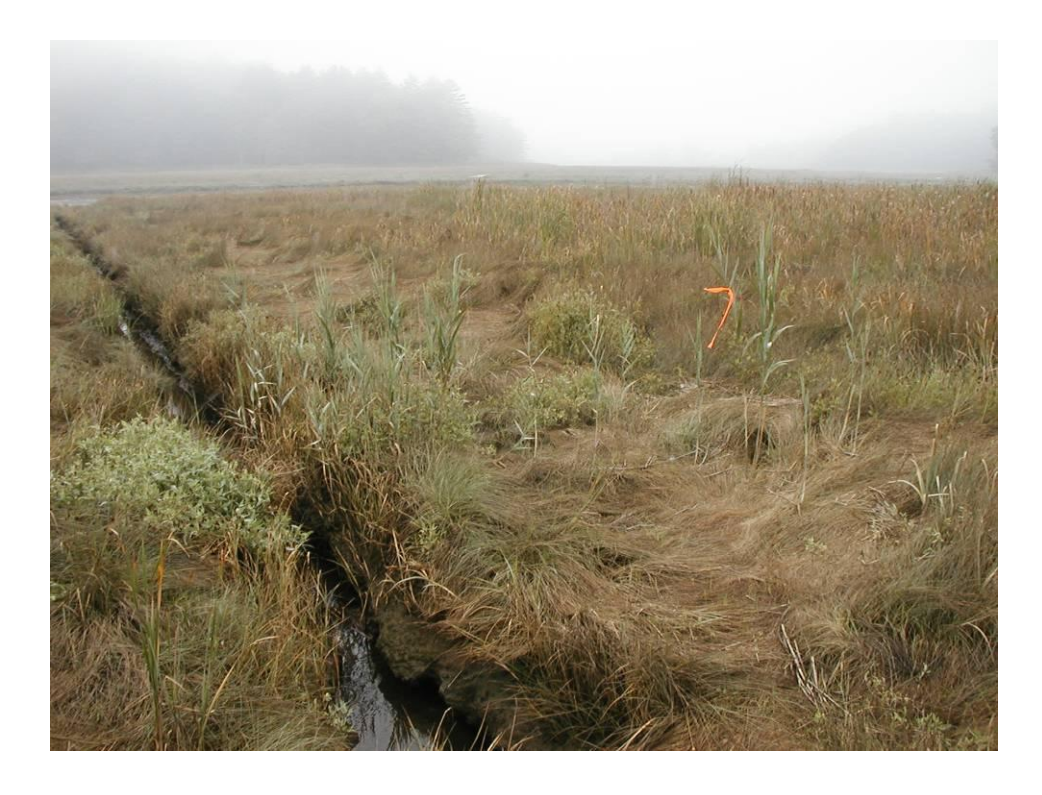
Photo 2. Small Phragmites patch adjacent to a tidal ditch. August 2008.