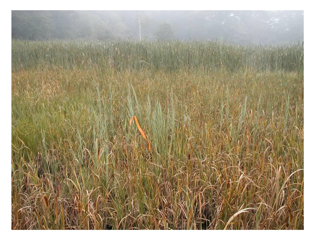
Photo 1. Typical small patch of Phragmites in Sherman Marsh mapped as a point location. August 2008.